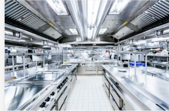
Galleys, Bars and Laundries