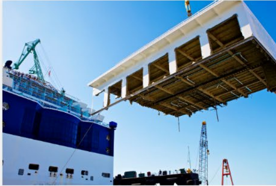
Complete Block Additions