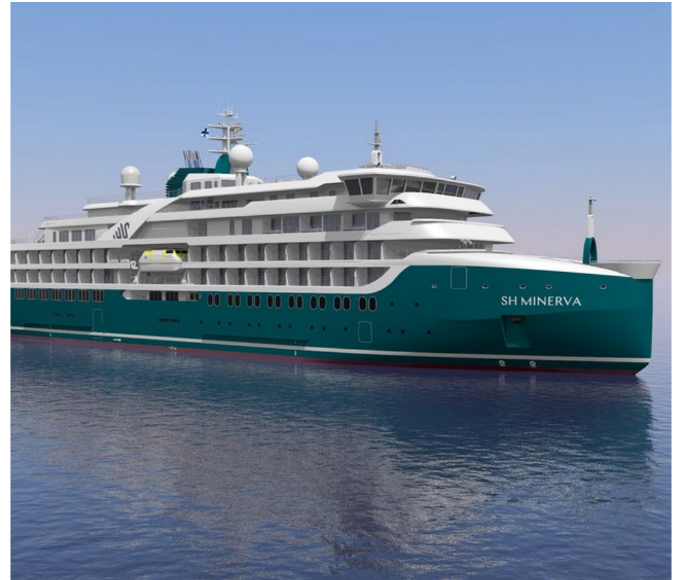
Vega project at Helsinki Shipyard