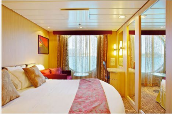
Cabins and Public Spaces